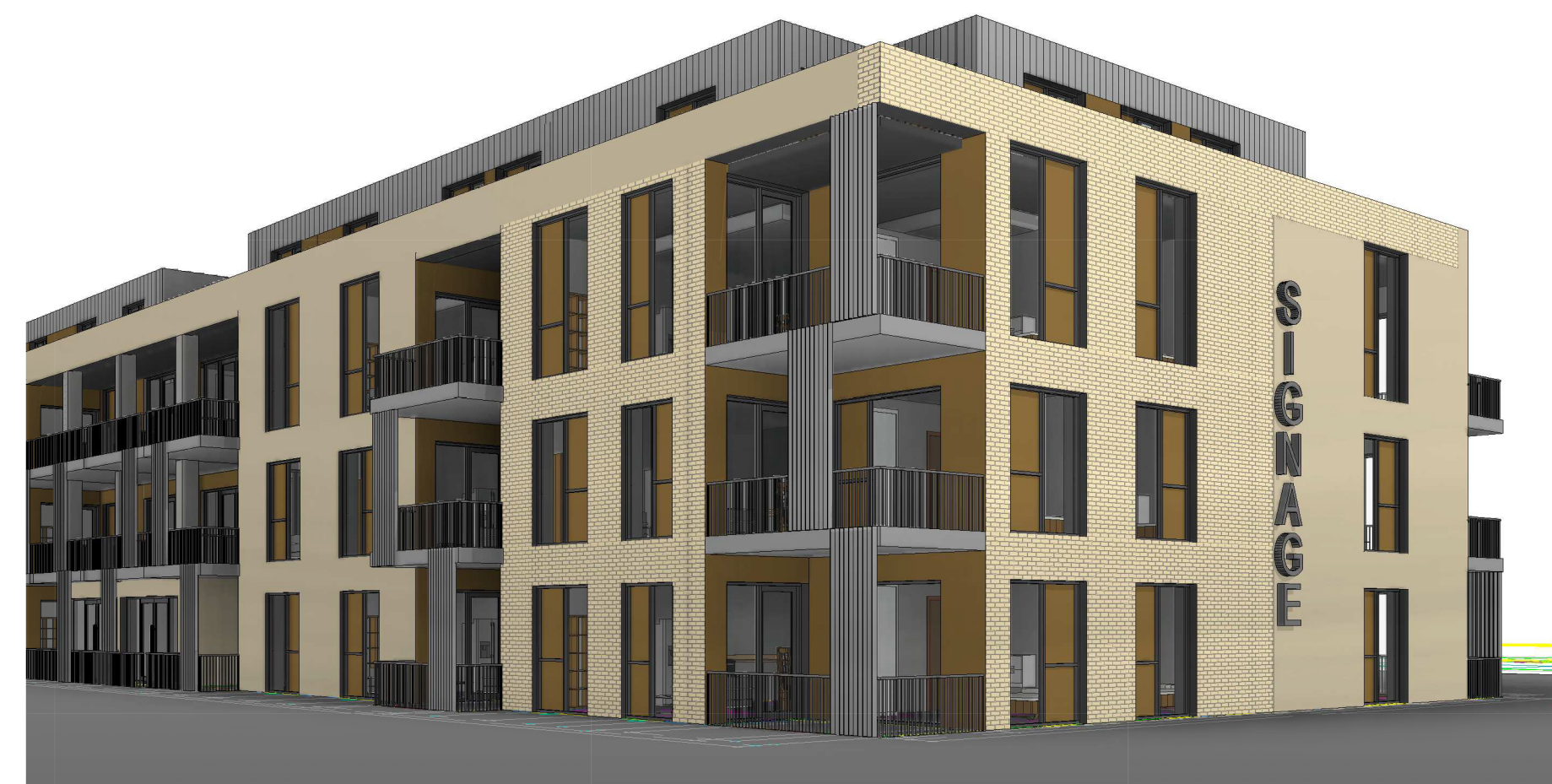
3 3D View. 1:100

NOTE: Levels shown on architectural block plans relate to local Ground Floor Level and do not relate to Ordnance Datum. For Finished Ground Floor Levels related to Ordnance Datum see DBFL Engineers drawings numbered. 180002-2000 Roads Layout / 180002-2001 Roads Layout Sheet 1 / 180002-2002 Roads Layout Sheet 2